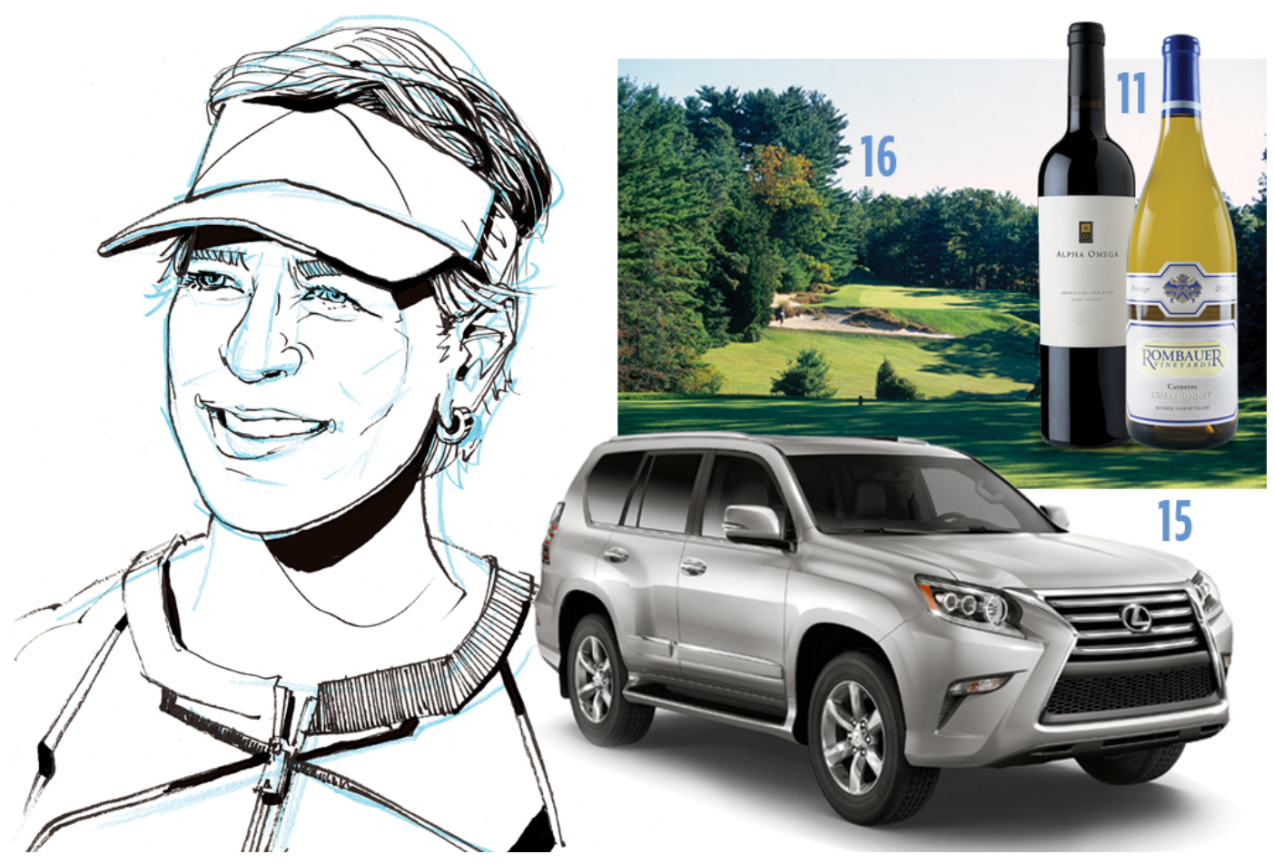
Illustration by Graham Smith

Orlando-based Annika Sörenstam is women's golf's most dominant figure: The only woman to exceed $20 million in LPGA earnings, she was also the first woman to shoot 59 in a pro tournament.